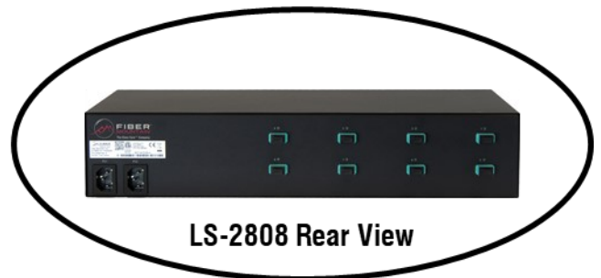
LS-2808 Rear View