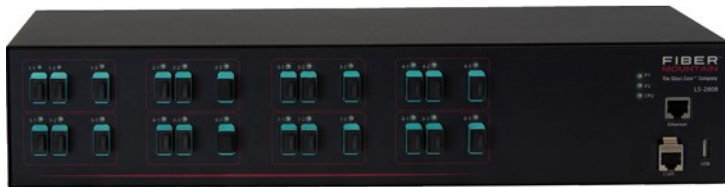
LS-2808 Front View

Fiber Mountain's LS-2808 Fiber Port Aggregator (FPA) provides multimode fiber breakout and aggregation with interactive per-port LED control for a wide range of networking devices, simplifying installation and maintenance of increasingly dense fiber networks. It provides LED indicators for each port, which can be controlled remotely via Fiber Mountain's AllPath Director (APD) orchestration software. Occupying only 2 RU, the LS-2808 FPA can break out or aggregate eight (8) MPO-24 interfaces with twenty-four (24) MPO-8 interfaces, with direct port mapping and per-port LEDs.