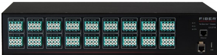
LS-2718 Front View

Fiber Mountain's LS-2718 Fiber Port Aggregator (FPA) provides multimode fiber breakout and aggregation with interactive per-port LED control for a wide range of networking devices, simplifying installation and maintenance of increasingly dense fiber networks. It provides LED indicators for each port, which can be controlled remotely via Fiber Mountain's AllPath Director (APD) orchestration software. Occupying only 2 RU, the LS-2718 FPA can break out or aggregate seventy-two (72) Duplex LC interfaces with eighteen (18) MPO-8 interfaces, with direct port mapping and per-port LEDs.