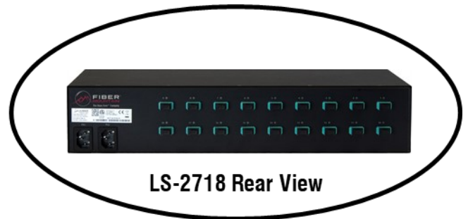
LS-2718 Rear View