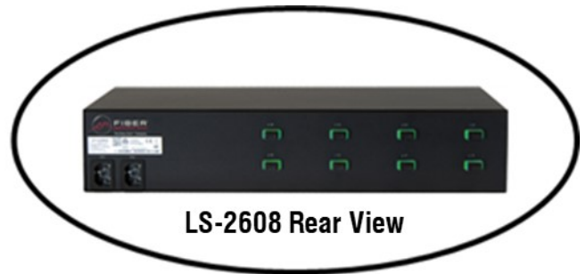
LS-2608 Rear View