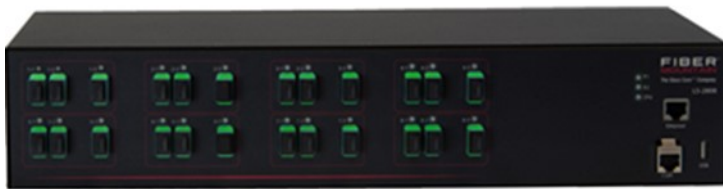
LS-2608 Front View

Fiber Mountain's LS-2608 Fiber Port Aggregator (FPA) provides single mode fiber breakout and aggregation with interactive per-port LED control for a wide range of networking devices, simplifying installation and maintenance of increasingly dense fiber networks. It provides LED indicators for each port, which can be controlled remotely via Fiber Mountain's AllPath Director (APD) orchestration software. Occupying only 2 RU, the LS-2608 FPA can break out or aggregate eight (8) MPO-24 interfaces with twenty-four (24) MPO-8 interfaces, with direct port mapping and per-port LEDs.