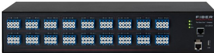
LS-2512 Front View

Fiber Mountain's LS-2512 Fiber Port Aggregator (FPA) provides single mode fiber breakout and aggregation with interactive per-port LED control for a wide range of networking devices, simplifying installation and maintenance of increasingly dense fiber networks. It provides LED indicators for each port, which can be controlled remotely via Fiber Mountain's AllPath Director (APD) orchestration software. Occupying only 2 RU, the LS-2512 FPA can break out or aggregate seventy-two (72) Duplex LC interfaces with twelve (12) MPO-12 interfaces, with direct port mapping and per-port LEDs.