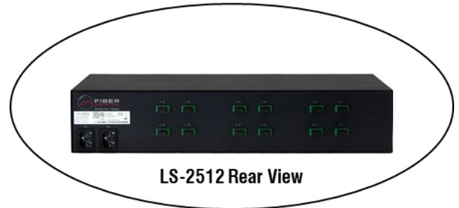
LS-2512 Rear View